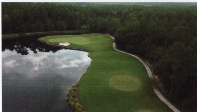
The 13th hole at SJGCC

Delicately carved out of a pine forest, the course features five sets of tees plus a family tee. Depending on the wind, it can play gently or be a true test while native wildlife adds to the natural beauty of every round.